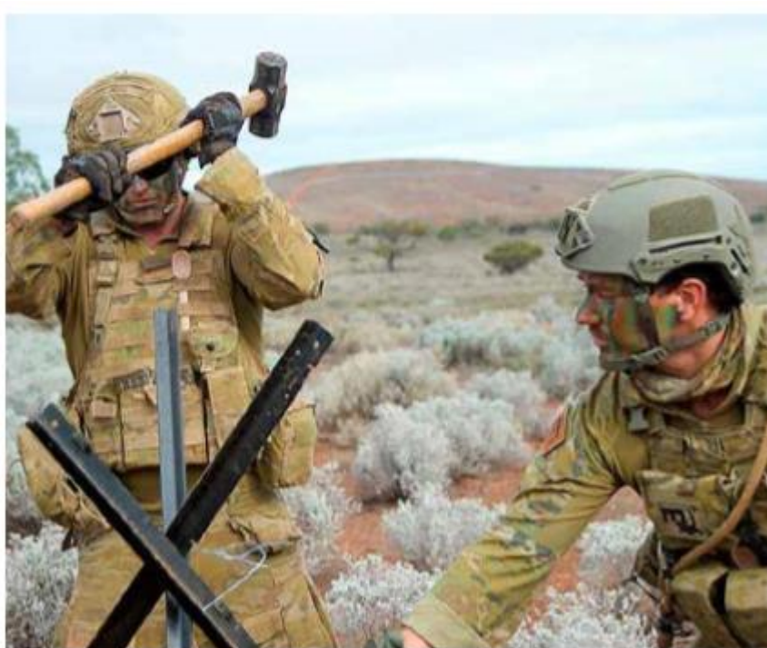
Sappers from 9 Fd Sqn, 1CER, build obstacles at a simulated defensive position.

9 Fd Sqn was involved in the 1 Brigade Exercise “Predator’s Walk” which was run over the period 14 – 25 May in the Army training areas in the NT and SA.