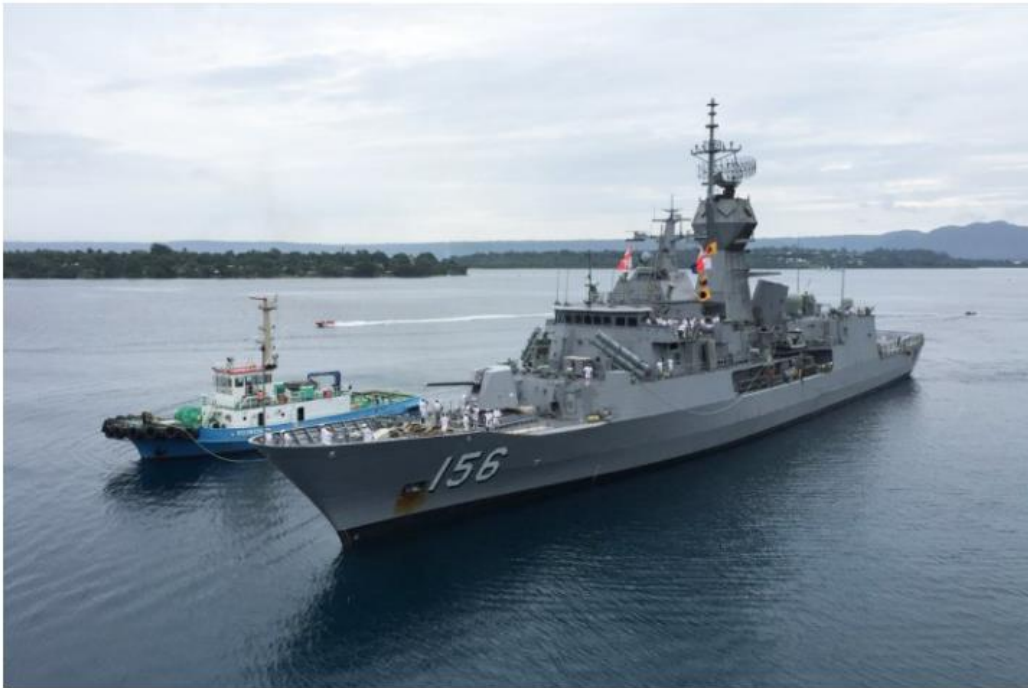
HMAS Toowoomba is led to Lapetasi Wharf, Port Vila, Vanuatu, by a local pilot boat during Indo-Pacific Endeavour 2018.

Two Royal Australian Navy ships from Joint Task Group 661.1 have arrived in Vanuatu to conduct the first port visit of the Indo-Pacific Endeavour 2018 (IPE18) program.