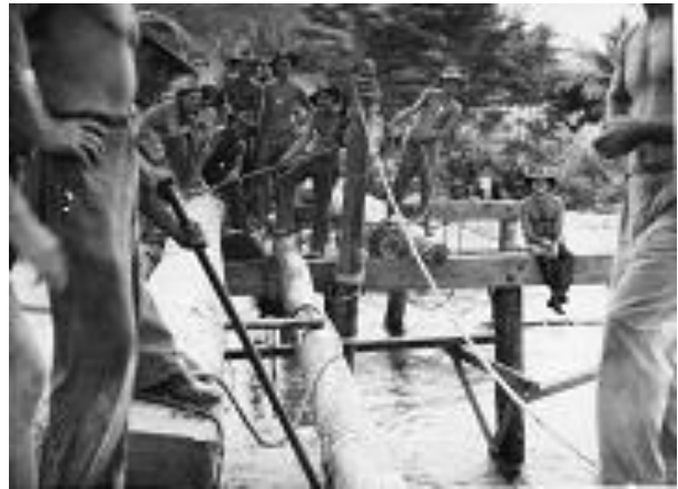
13 Field Company constructing a timber bridge in New Britain during WW2