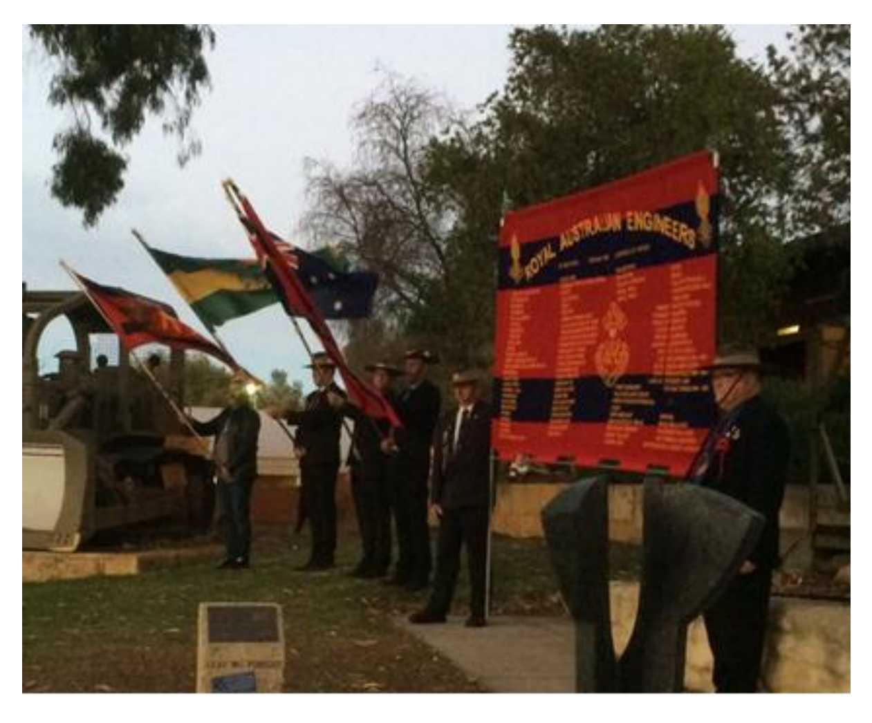
FLAG BEARERS, ANZAC DAY 2015