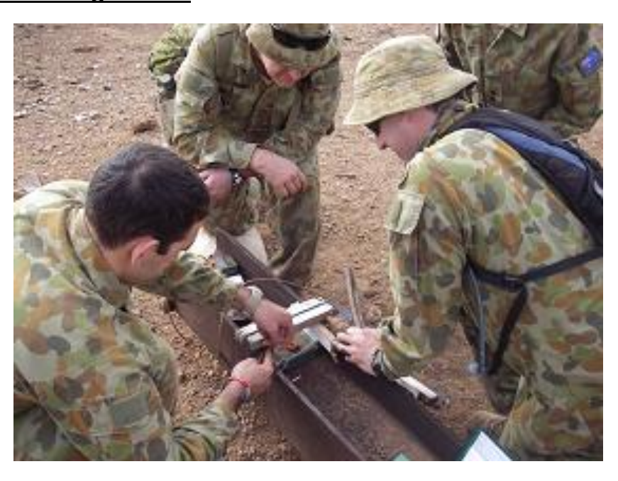
Sappers preparing explosive charges on a steel "I" beam

Since the last 'Purple Circle', 13 Field Squadron have participated in 2 training weekends at Bindoon. On the W/E 15-17 May the Unit participated in weapon training exercises with 13 Brigade Group. Then on the W/E 12-14 June the Unit carried out demolitions training.