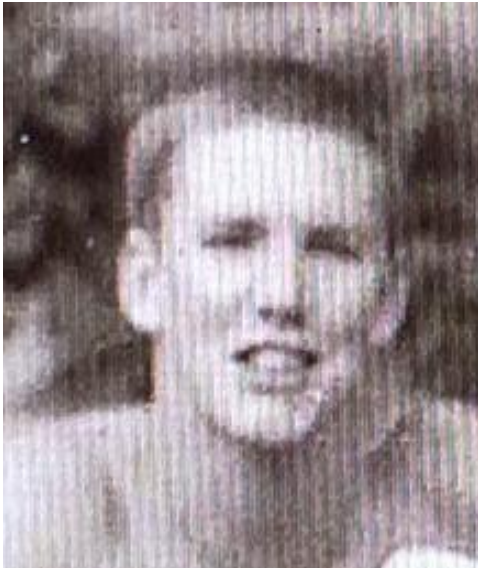
A young Sapper in New Guinea