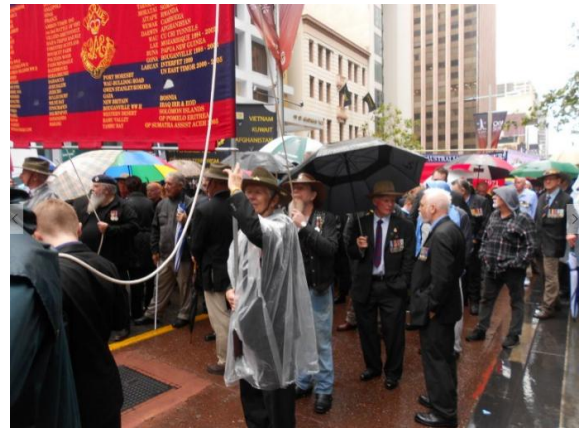
Standing in the rain waiting for the order to move off.

Once we started the march the rain was soon forgotten. Half way along St Georges Terrace it stopped raining which improved conditions for the rest of the march. That was until we got to Langley Park where the ground was soggy and puddles of water everywhere.