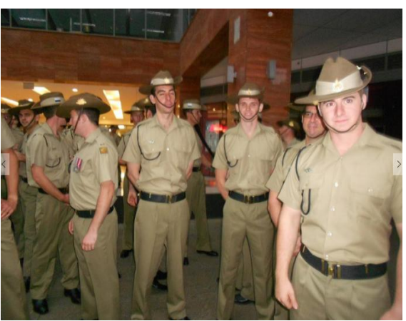
Sappers making the most of the dry before the march

We have to feel sorry for the servicemen who marched in uniform. The Sappers were able to shelter from the light rain before the march but were called onto the road to form up just as the heavy rain started.