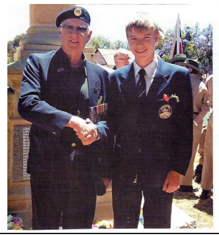
Remembrance Day - 2014