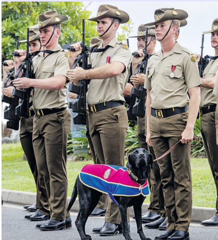
3CER soldiers on parade with their detection dog.

In a first for the Whitsunday region, members of 3CER conducted a freedom-of-entry parade at Airlie Beach on May 11.