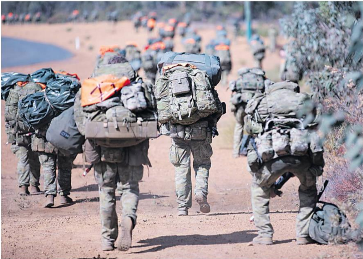
ADF candidates march in to camp during the 2024 special forces selection course.