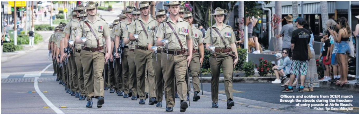
Officers and soldiers from 3CER march through the streets during the freedom-of-entry parade at Airlie Beach.