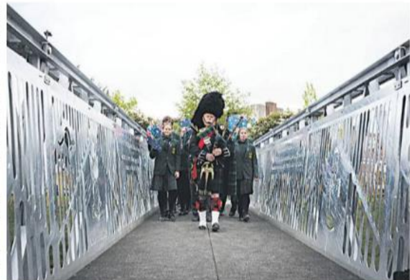
Accompanied by French school students, an Australian bagpiper walks across the Bridge of Friendship in Amiens at its official opening.