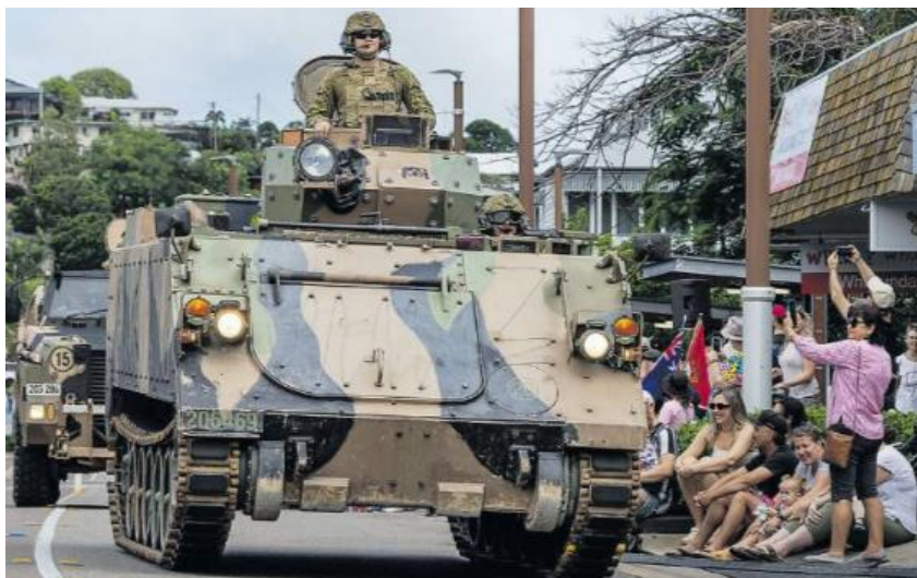
An APC from 3CER moves through the streets of Airlie Beach during the parade.

Despite being granted freedom of entry in 2017 in recognition of their invaluable assistance in Bowen following Tropical Cyclone Debbie, the parade was not held until this year because of the cyclone damage and the COVID-19 pandemic.