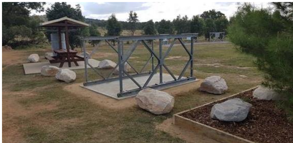
The Kapooka Tragedy Memorial