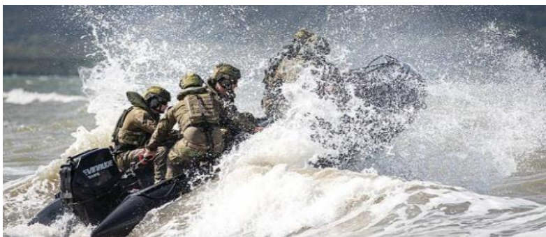
8CE Sqn sappers tackle the surf as they achieve their small-boat certification during Exercise Thunder Strike.

"Everyone put in a really good effort; we executed the commander's intent and I'm really proud of the team."