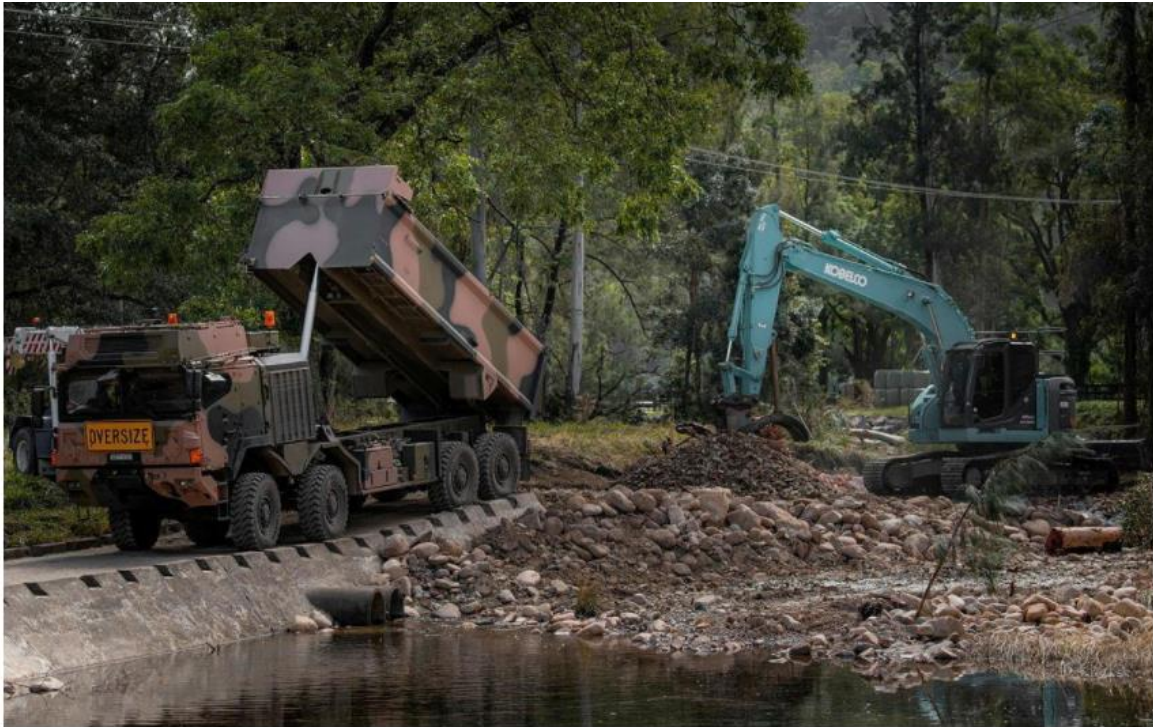
An Army HX77 and excavator being used to reconstruct a bridge near Wauchope, NSW, which was damaged by the floods.

Sappers from the 2nd Combat Engineer Regiment (2CER) put their skills to good use on Operation NSW Flood Assist, repairing a bridge near Wauchope damaged by the floods.