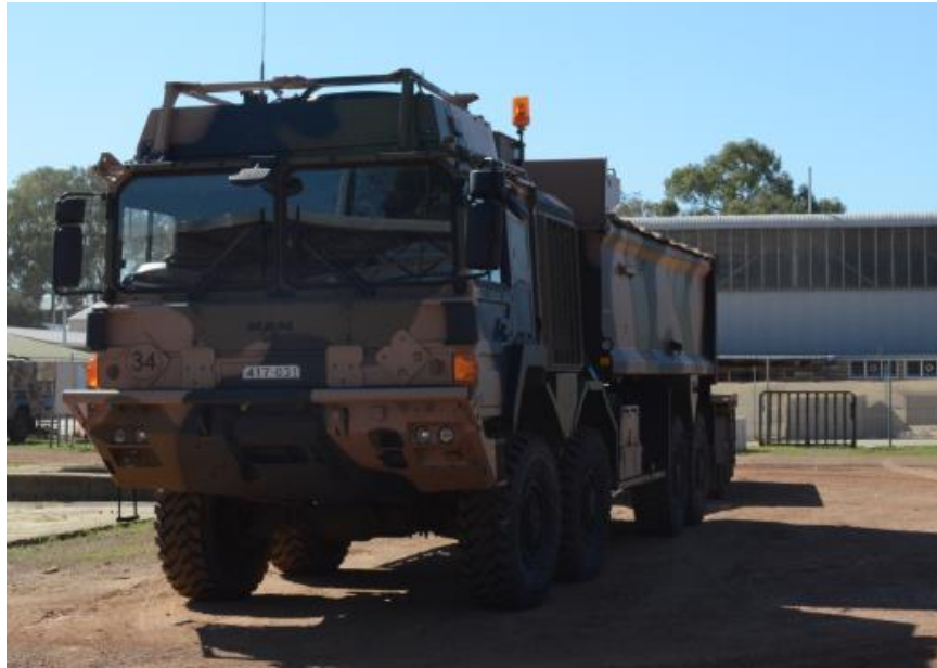
The Squadron's new MAN HX77 dump truck