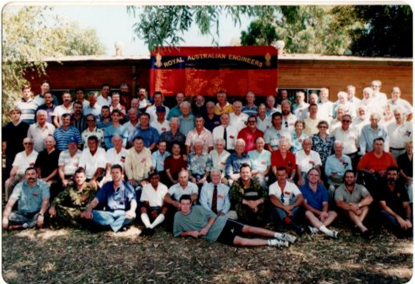
Association members photographed after a General Meeting in February 1999. Names of attendees shown on last page.