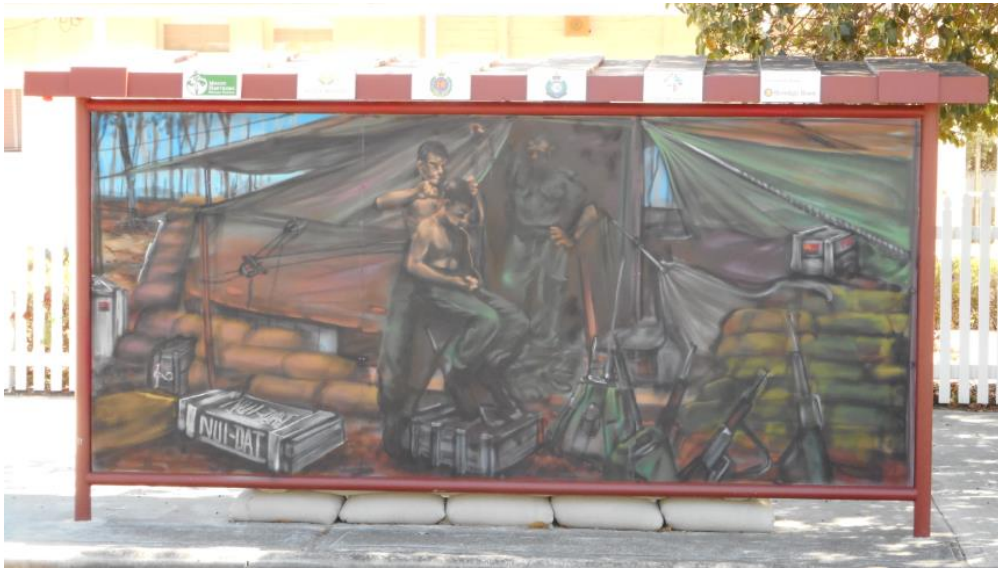
Vietnam bus shelter on Anzac Rd, Mt Hawthorn