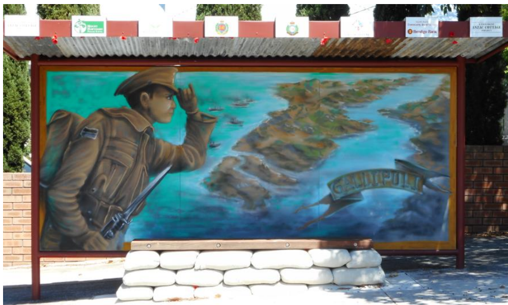
Gallipoli bus shelter on Kalgoorlie St, Mt Hawthorn