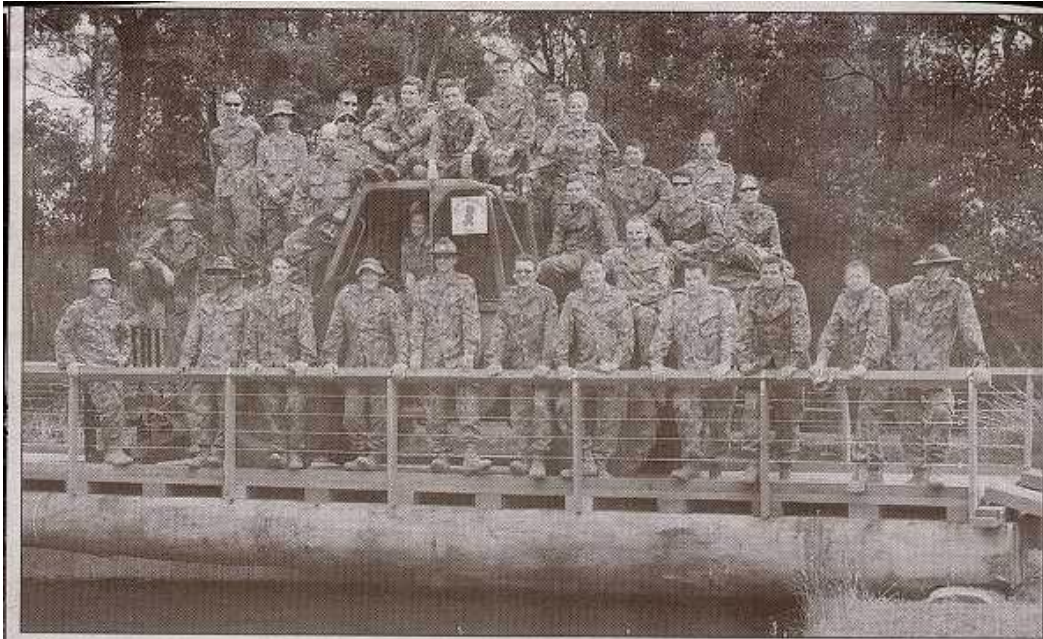
Members of the 13th Field Squadron Royal Australian Engineers on the replica of One Tree Bridge which they constructed at the Timber Park during the weekend.