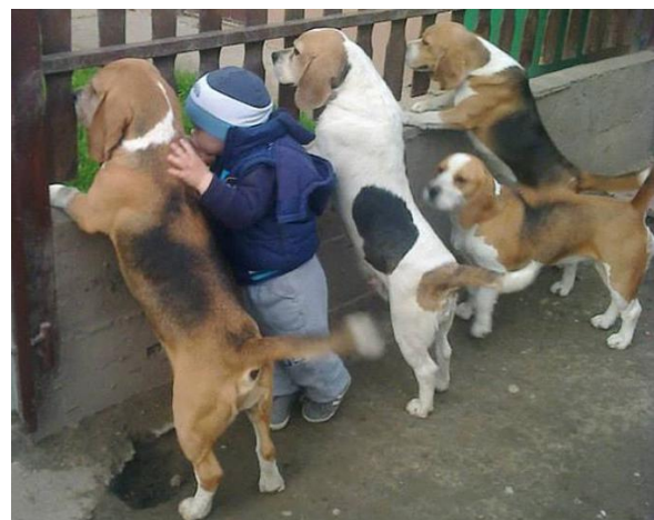
Friends having a common interest