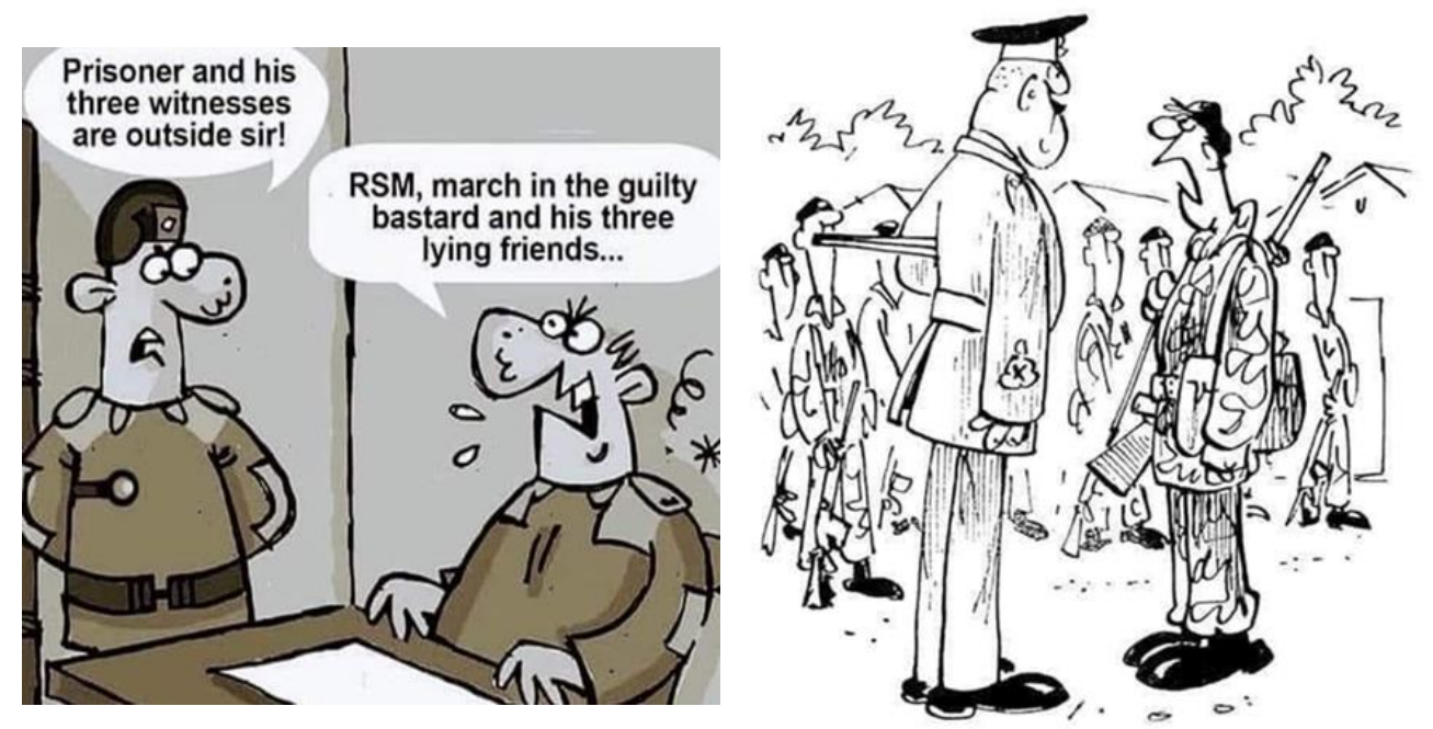
"What's the point of my staying on in the Army if we're going to row every time I'm late in the morning"