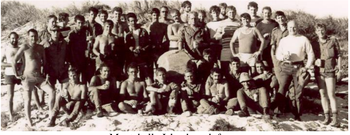
Montebello Island work force