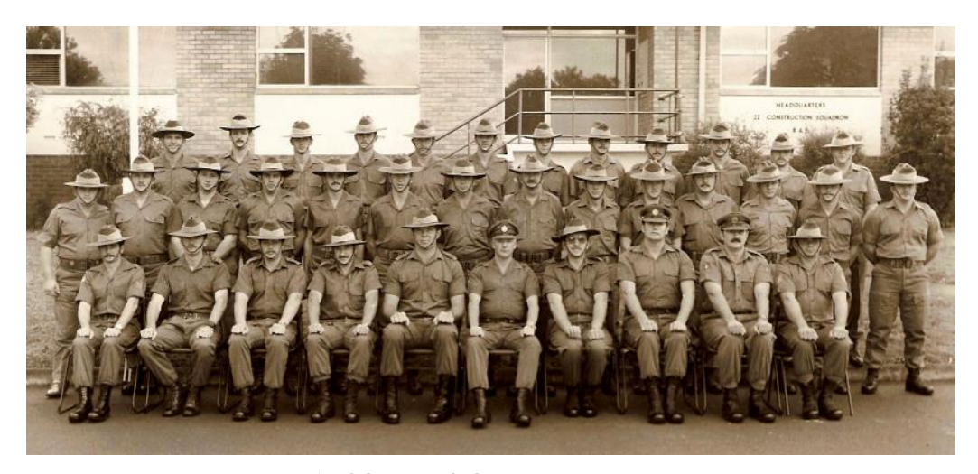
1983 Head Quarters Troop