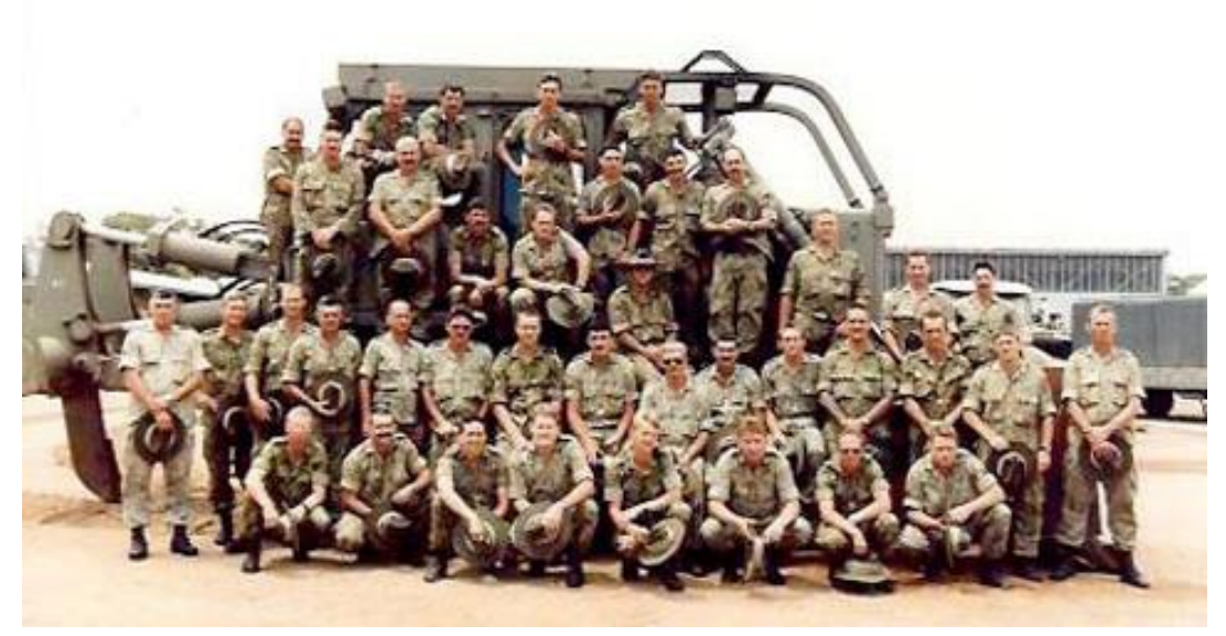
1990 Plant Troop