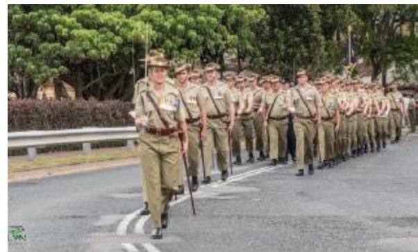
Exercising their right of the Freedom of the City of Redcliffe